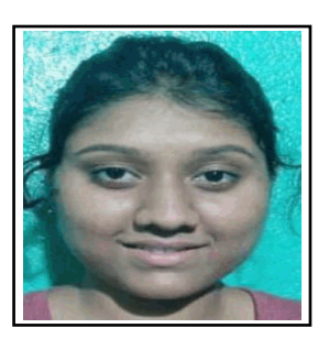
Swarting a Chatteryer